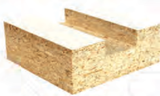
Laminates & Melamines

Cuts Clean Flat-Bottom Grooves in Materials such as: