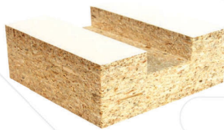
Laminates & Melamines

Cuts Clean Flat-Bottom Grooves in Materials such as: