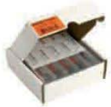
10 pcs. in Masterpack

Tough, versatile, fast-cutting CMT Flush Trim bits are ideal for a wide variety of trimming jobs. We offer a wide range of sizes that are sure to satisfy any woodworking need. Use these carbide tipped bits for precision work on laminates or for quick template work with excellent finish results.