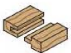
Tongue and groove joint