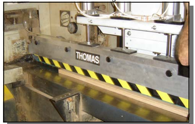
Six-Wheel Bridge Feeder